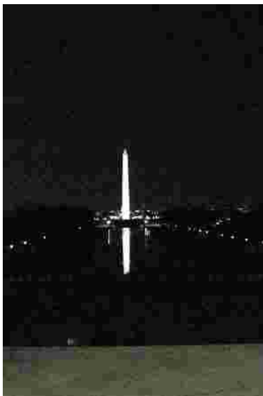
The Washington Monument