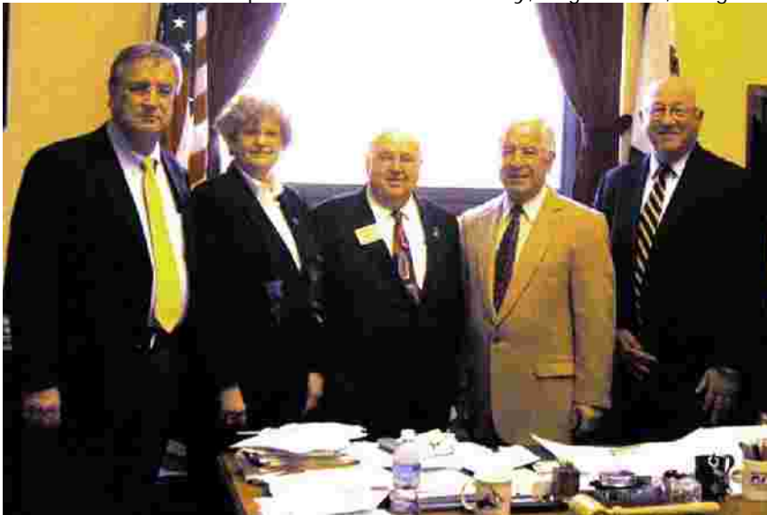
WVFDA Group with Congressman Rahall