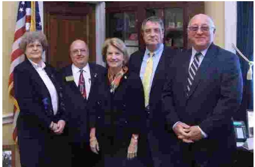
WVFDA Group with Congresswoman Capito