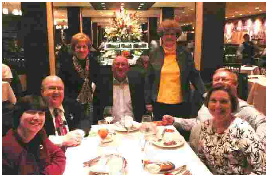
WVFDA Representatives at Washington D.C.