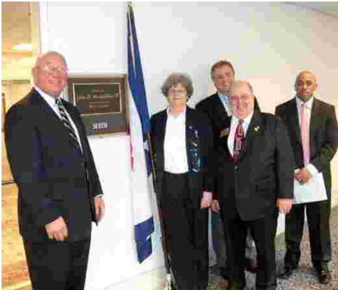
WVFDA Representatives visit Senator Rockefeller's Office