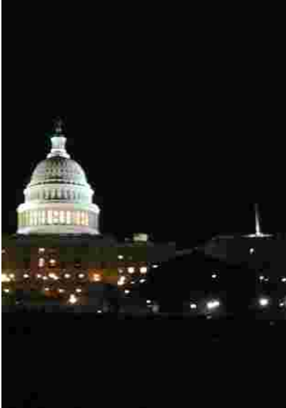
Our Nation's Capitol