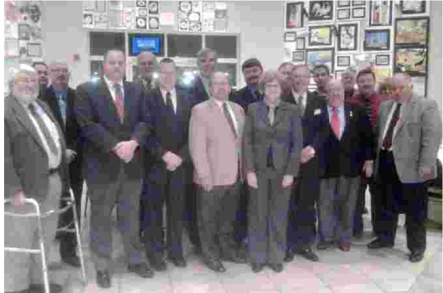
WVFDA Members at District 2 & 3 Meeting